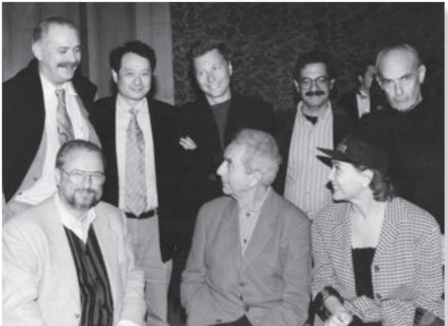
Manchevski and Oscar nominee colleagues Nikita Mikhalkov, Ang Lee, Gérard Corbiau, Tomás Gutiérrez Alea and Juan Carlos Tabío with Michelangelo Antonioni