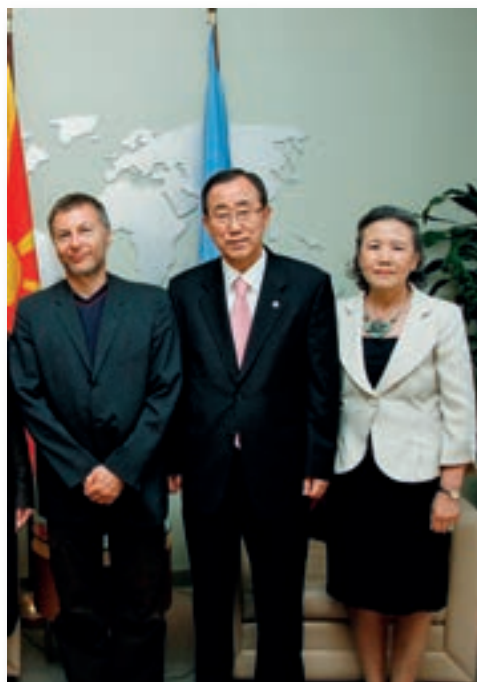
With Ban Ki-moon, UN Secretary General